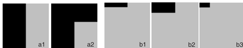
Figure 2 Predictive scenarios yielding a kappa score of 0.6. a1 and b1 represent the real distribution of two species (a and b), and a2, b2, and b3 the predicted distributions. The presence of the species is represented in black, and its absence in grey. In the first example, species a occupies half of the considered territory, and a kappa value of 0.6 can be obtained when the model overpredicts the presence of the species by 40%. Note that, in this case, the inverse is also true, i.e. if black was absence and grey presence, the model would underpredict the presence of the species by 40%. In the second example, species b occupies 5% of the considered territory, and a kappa value of 0.6 is obtained when the model overpredicts the presence of the species by 102% (b2; i.e. the predicted geographical range is duplicated with respect to the real range), or when the model underpredicts the presence of the species by a 44% (b3).

Regardless of any conceptual misunderstanding, species distribution models could provide good predictions if they fit the evaluation data tightly. Sometimes it could be possible to forecast a given part of the realized distribution of a species using methods that are more adequate to describe its potential distribution. In this case, it is necessary to be particularly demanding in the evaluation of the agreement between observations and predictions. However, the discrimination between 'good' and 'bad' models is based in subjective ranges of indices that measure only if the agreement between predicted and observed distribution is significantly higher than the expected by chance. For example, in the case of the kappa statistic, values equal or smaller than 0.6 are commonly thought to indicate reliable predictions (i.e. a good agreement between observed and predicted distributions; see, e.g. Elith et al. , 2006; Araújo & Luoto, 2007; or Tsoar et al. , 2007). However, a kappa value of 0.6 can be obtained with degrees of under- or overprediction of 40%, for a species that occupies half of the territory (Fig. 2a). In the case of a rare species occupying